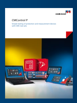
Product catalog (secondary equipment)